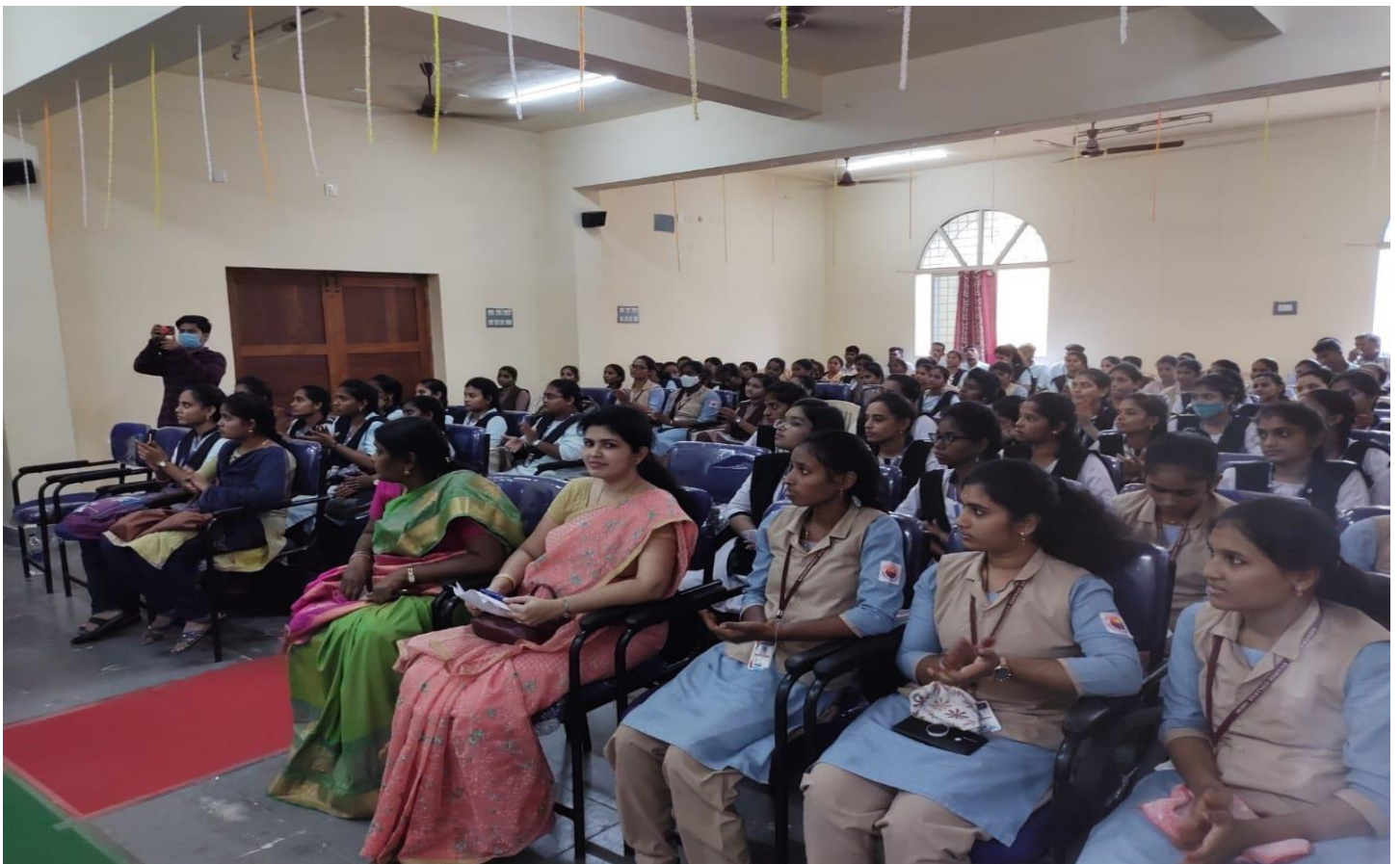
Participants attended to the Event