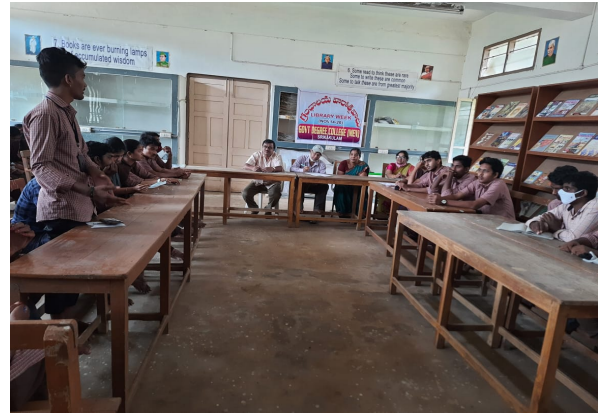
Inaugural Event and Debate Competition