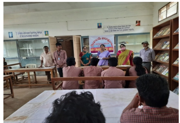
Book Review and Valedictory