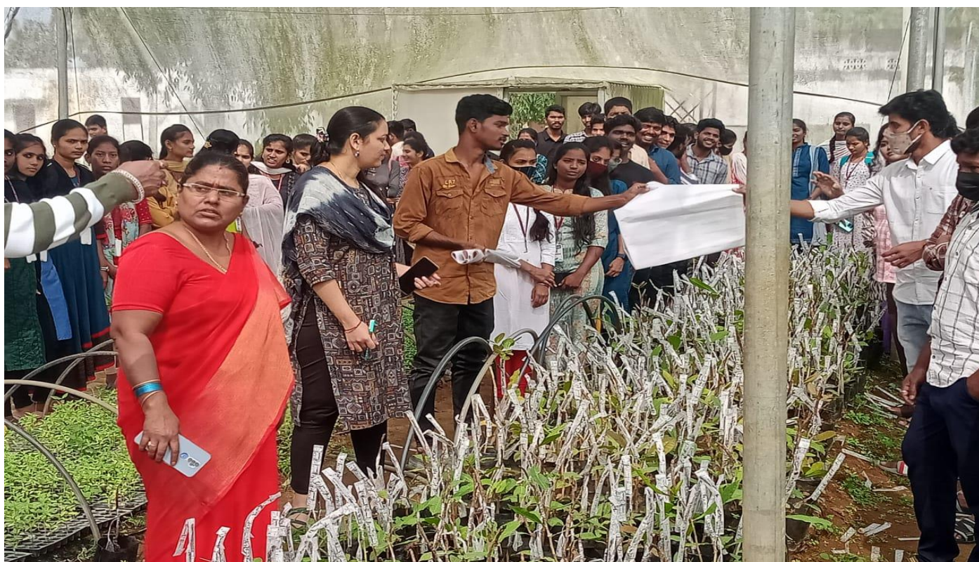
Explaining about uses of Green House & Shade nets