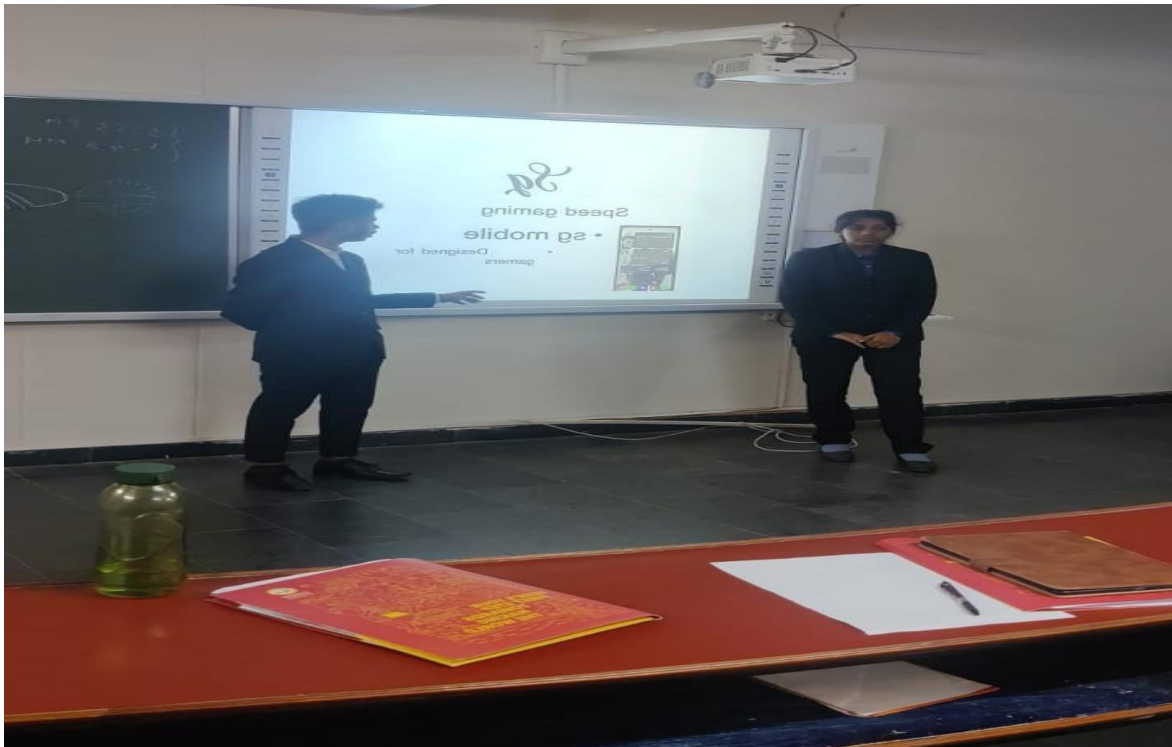
Presentation of the Task