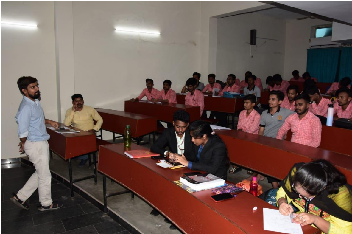
Preparation of task under the direction of Organizer

Students are assigned to prepare a poster with out any digital assistance. Among 7 groups selected only 4 groups for presentation of poster. They Assigned 4 different products for 4 different groups and also asked the students to promote sales in the competitive market. Based on that performance they given 1 st place and 2 nd place to the participants.