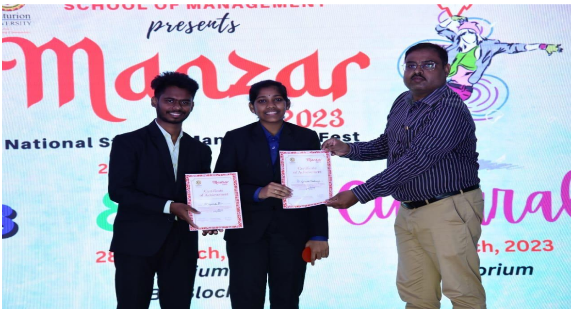
Received Certificates from organizers