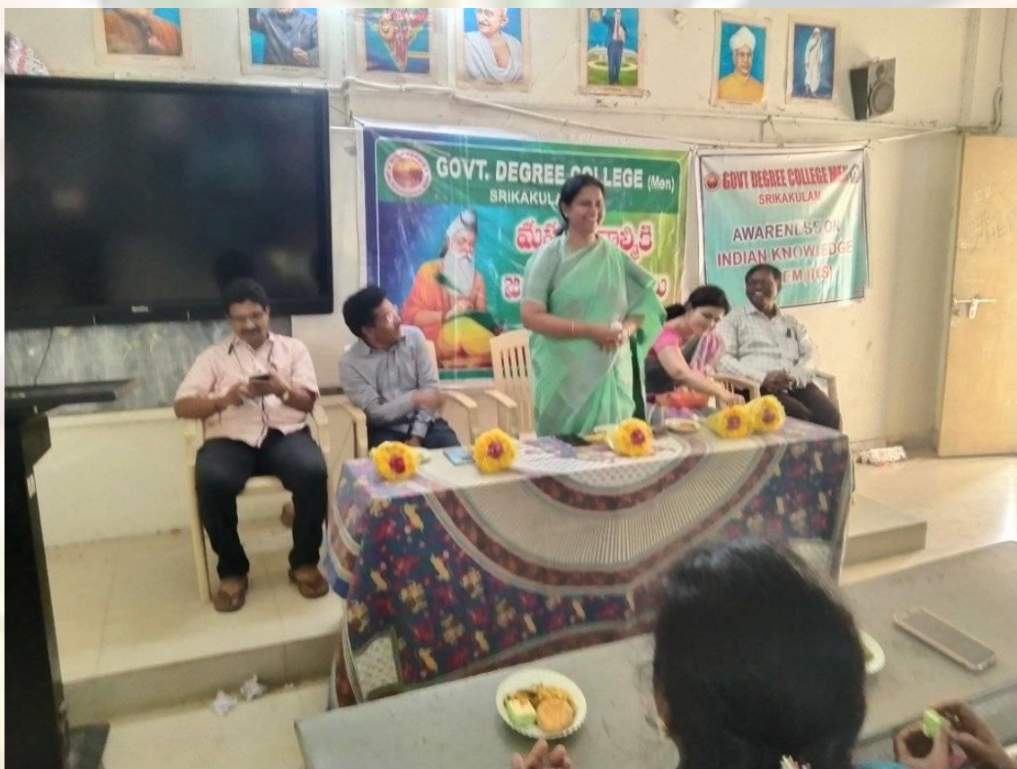
Celebrations of Valmiki Jayanthi