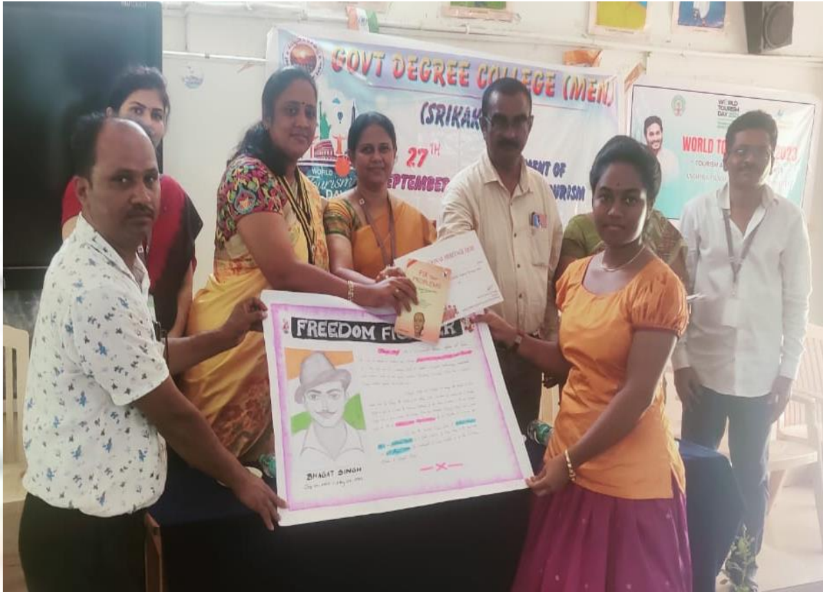
Celebration of Tourism Day