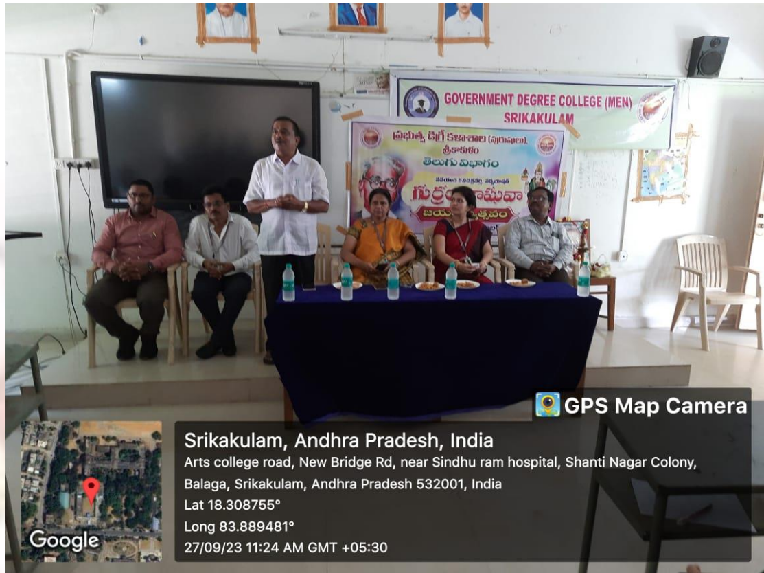
Celebrations of Gurram Joshua Jayanthi