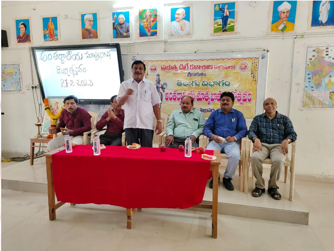
Celebrations of International Mother Tongue Day