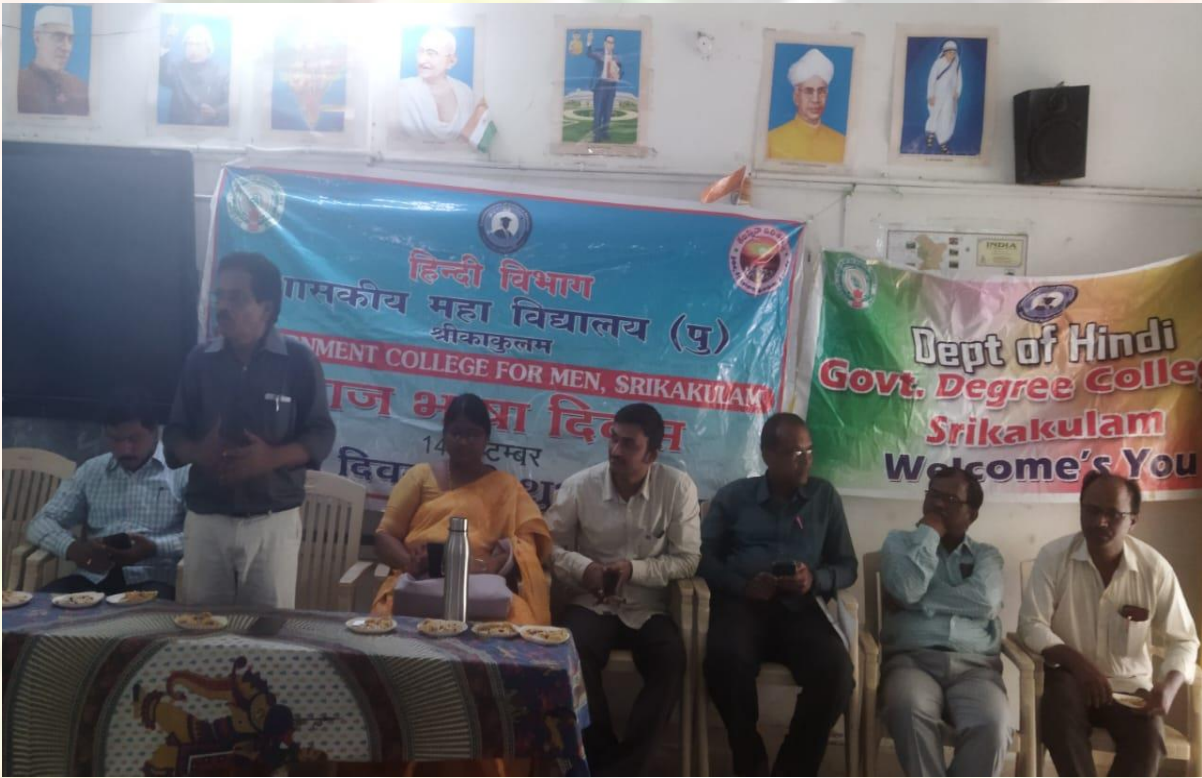
Celebrations of Hindi Diwas