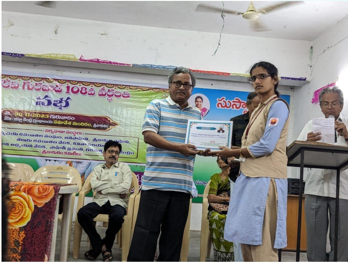
Prize Distribution: Essay Competition on Life Achievements of Gurajada Apparao

understanding the cultural and economic importance of tourism, students are encouraged to appreciate and preserve their rich cultural heritage.