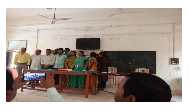
Prize Disturbutions to Students