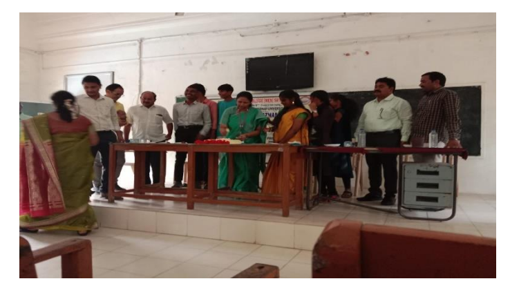
Cake Cutting by Principal