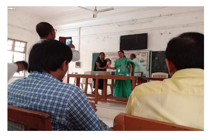
invite to Principal on the Stage