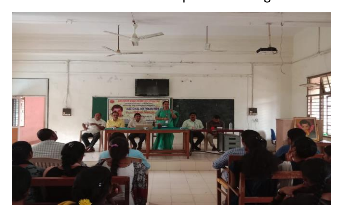
Speech by Principal