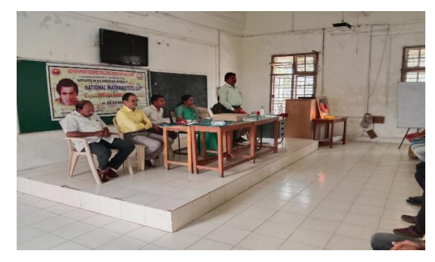
Speech by HOD of History & University Excuitive Member