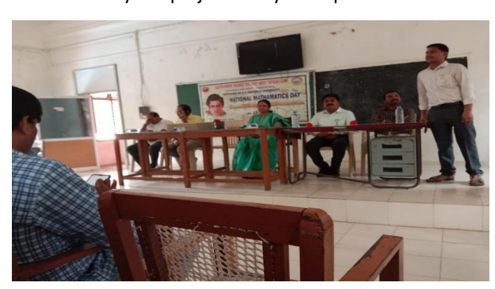
Speech by HOD of Mathematics