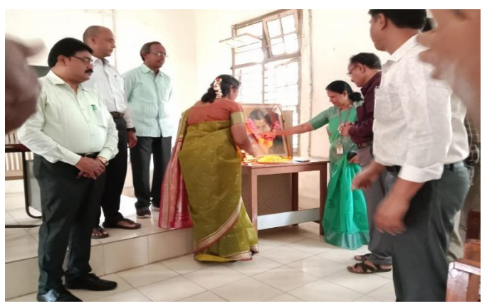
Jyothi prajvalana by Principal.