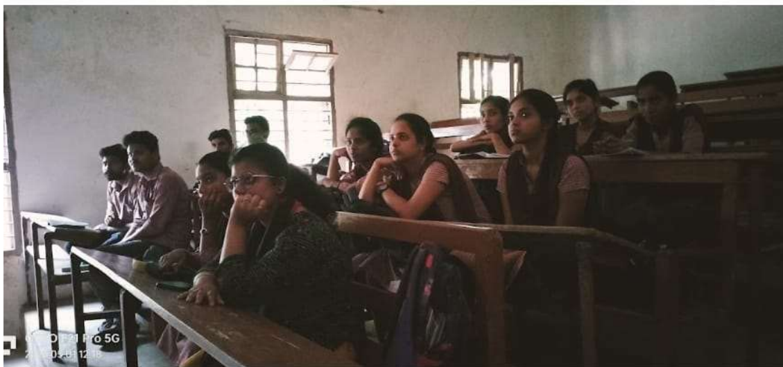
CLASS ON COORDINATION COMPOUNDS