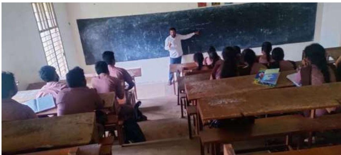
APPGCET 2020 PAPER ANALYSIS