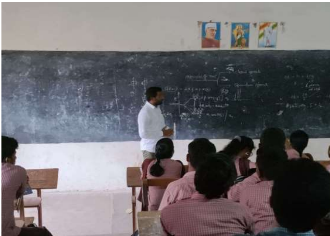
CLASS ON SPECTROSCOPY