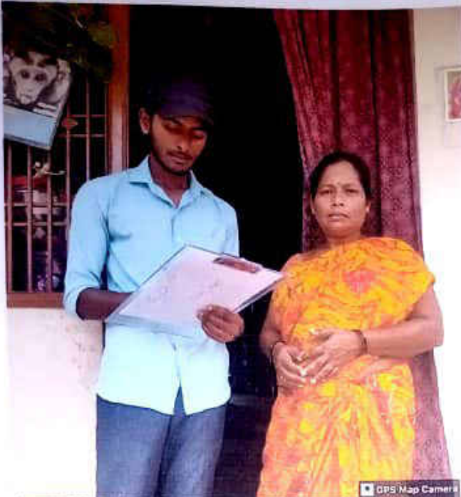
GPS Map Camera Vomaravalli, Andhra Pradesh, India 84FG+2F, Bandaruvanipeta Village, Vomaravalli, Andhra Pradesh 532406, India Lat 18.322126° Long 84.125581° 31/05/23 10:30 AM GMT +05:30 Google