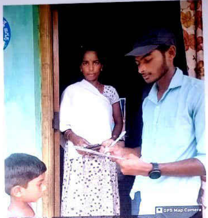
GPS Map Camera Vomaravalli, Andhra Pradesh, India 84FG+2F, Bandaruvanipeta Village, Vomaravalli, Andhra Pradesh 532406, India Lat 18.322178° Long 84.125923° 31/05/23 10:16 AM GMT +05:30 Google