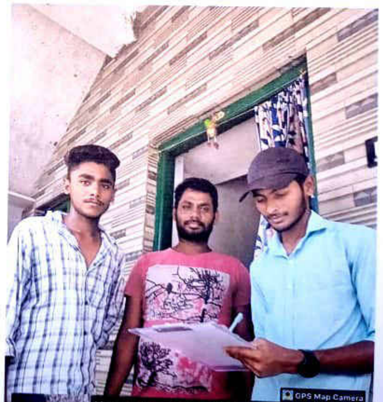
GPS Map Camera Vomaravalli, Andhra Pradesh, India B4FG+2F, Bandaruvanipeta Village, Vomaravalli, Andhra Pradesh 532408, India Lat 18.321998° Long 84.125461° 11/05/23 10:36 AM GMT +05:30