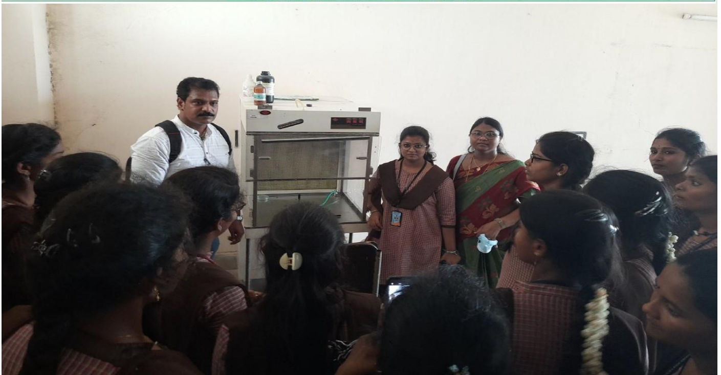
TISSUE CULTURE LAB AT NAIRA, SRIKAKULAM