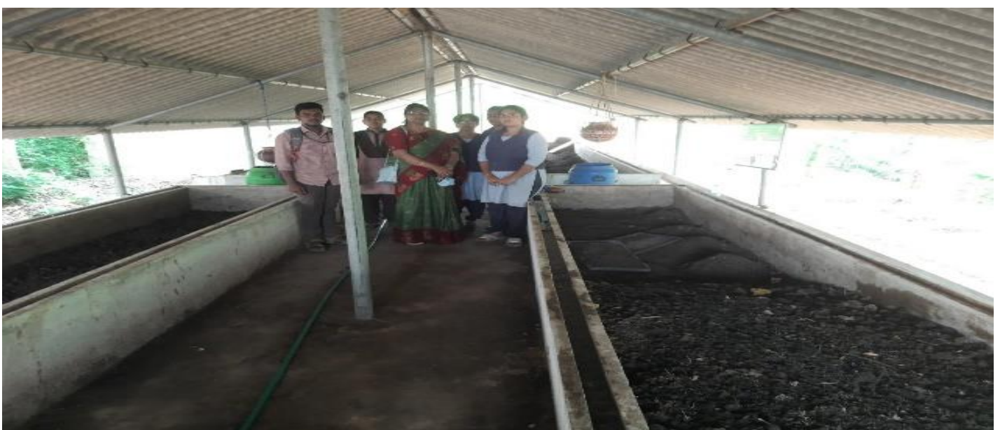
VERMI COMPOST UNIT AT NAIRA, SRIKAKULAM