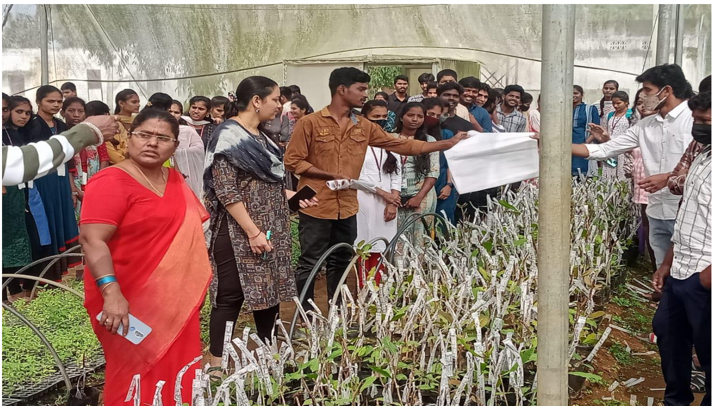
Explaining about uses of Green House & Shade nets