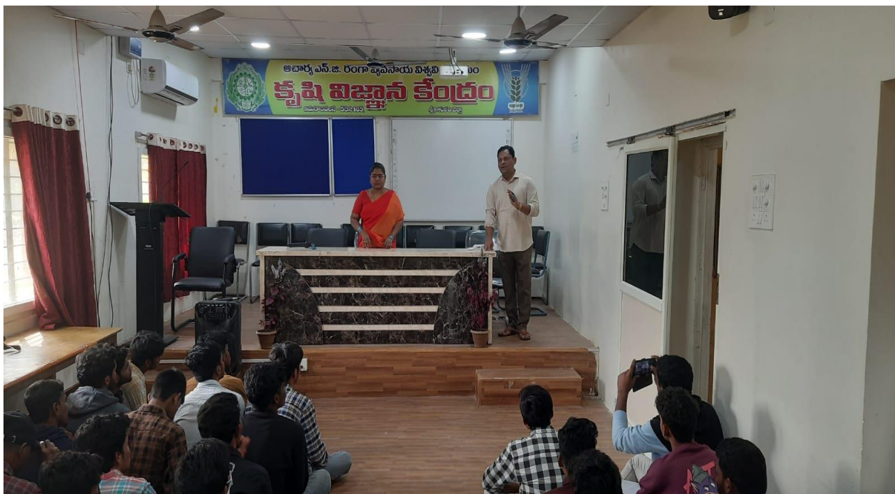
Demo & Interaction on Activities of KVK - Amadalavalasa