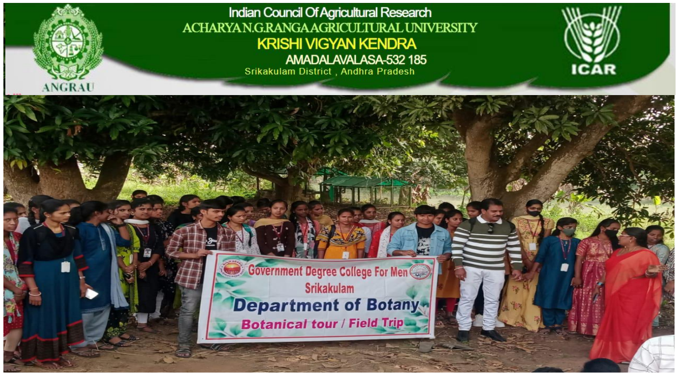
Explaining about Organic Farming