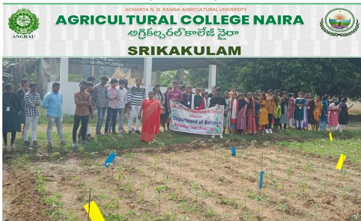
Demo on Organic farming of pulses and cereals