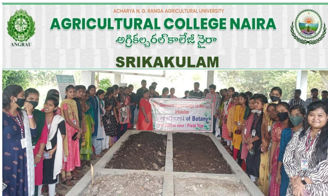
Demonstration of Vermicompost unit at NAIRA, SRIKAKULAM