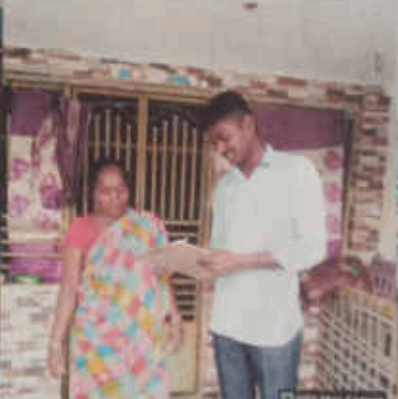
Srikakulam, Andhra Pradesh, India 17/05/23 07:07 AM GMT +05:30