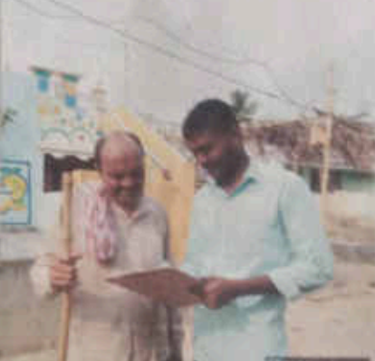
Srikakulam, Andhra Pradesh, India 17/05/23 07:07 AM GMT +05:30