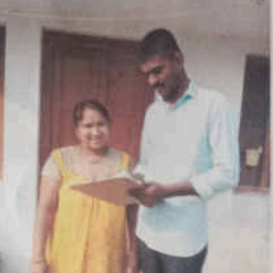
Srikakulam, Andhra Pradesh, India 17/05/23 07:03 AM GMT +05:30