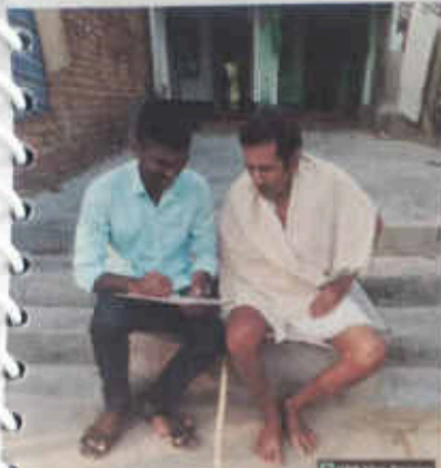
Srikakulam, Andhra Pradesh, India 17/05/23 07:07 AM GMT +05:30