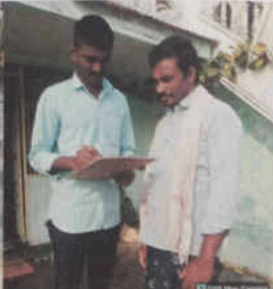
Srikakulam, Andhra Pradesh, India 17/05/23 07:07 AM GMT +05:30