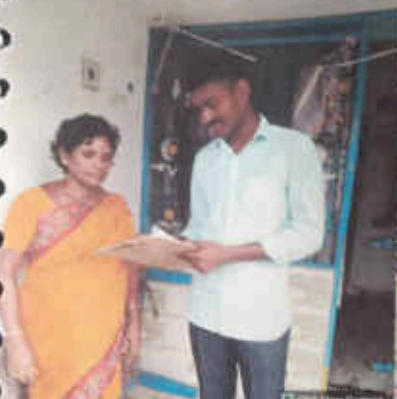
Srikakulam, Andhra Pradesh, India 17/05/23 07:07 AM GMT +05:30