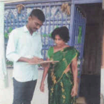
null 17/05/23 07:03 AM GMT +05:30