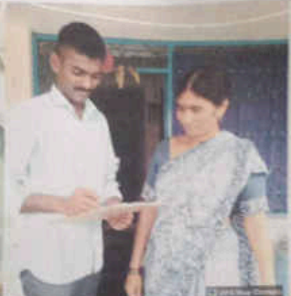
Srikakulam, Andhra Pradesh, India 17/05/23 07:07 AM GMT +05:30