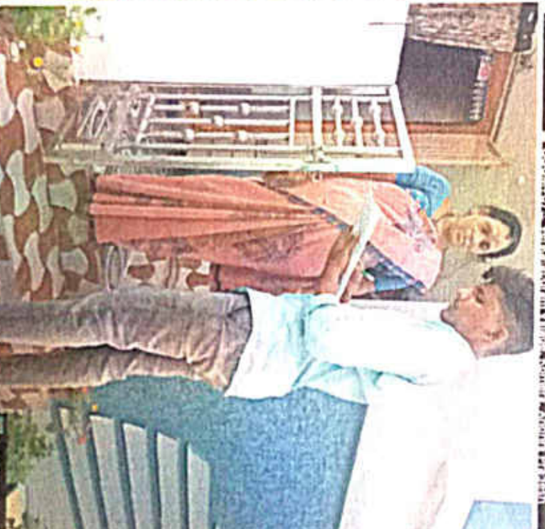
Ors Map Camera

Komera, Andhra Pradesh, India 000174, Venkatakrishna Village, Komera, Andhra Pradesh