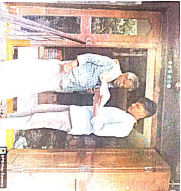
Ors Map Camera

Komera, Andhra Pradesh, India 000174, Venkatakrishna Village, Komera, Andhra Pradesh