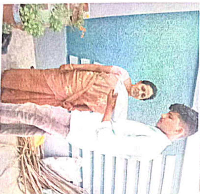
Ors Map Camera

Komera, Andhra Pradesh, India 000174, Venkatakrishna Village, Komera, Andhra Pradesh