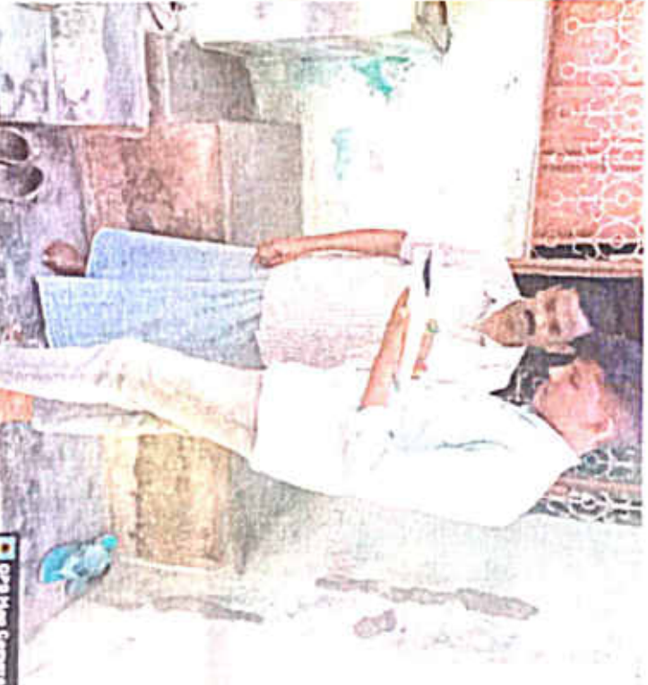
Ors Map Camera

Komera, Andhra Pradesh, India 000174, Venkatakrishna Village, Komera, Andhra Pradesh