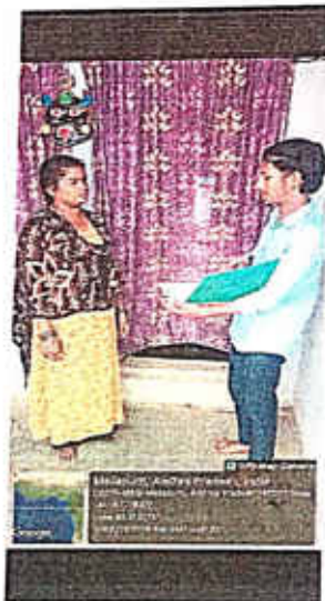
Melipattu, Andhra Pradesh, India 2004-04-22, Melipattu, Andhra Pradesh 151221, India Lat: 16.7794°N Long: 84.1747°E W: 16.7794 N 84.1747 E