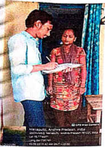
Melipattu, Andhra Pradesh, India 2004-04-22, Melipattu, Andhra Pradesh 151221, India Lat: 16.7794°N Long: 84.1747°E W: 16.7794 N 84.1747 E