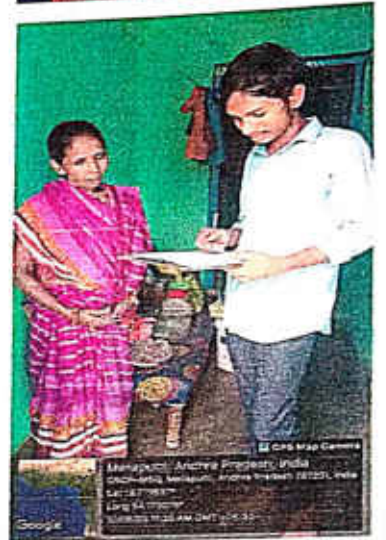
Melipattu, Andhra Pradesh, India 2004-04-22, Melipattu, Andhra Pradesh 151221, India Lat: 16.7794°N Long: 84.1747°E W: 16.7794 N 84.1747 E