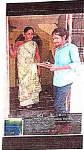
Melipattu, Andhra Pradesh, India 2004-04-22, Melipattu, Andhra Pradesh 151221, India Lat: 16.7794°N Long: 84.1747°E W: 16.7794 N 84.1747 E