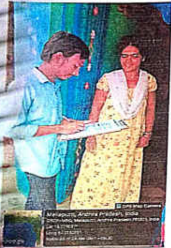
Melipattu, Andhra Pradesh, India 2004-04-22, Melipattu, Andhra Pradesh 151221, India Lat: 16.7794°N Long: 84.1747°E W: 16.7794 N 84.1747 E