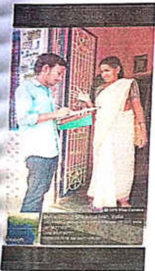
Melipattu, Andhra Pradesh, India 2004-04-22, Melipattu, Andhra Pradesh 151221, India Lat: 16.7794°N Long: 84.1747°E W: 16.7794 N 84.1747 E