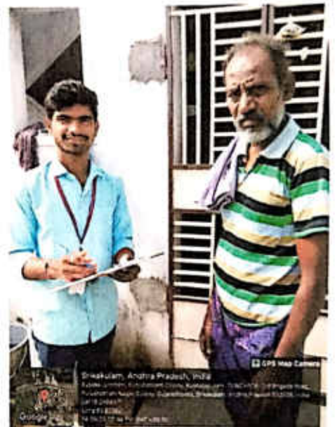
Srikakulam, Andhra Pradesh, India 14.25.2022 11:42 AM GPS Map Camera