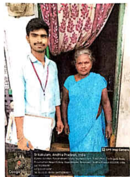
Srikakulam, Andhra Pradesh, India 14.25.2022 11:42 AM GPS Map Camera