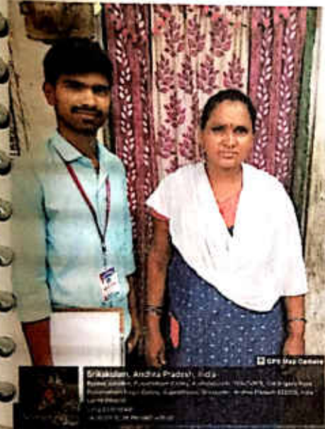
Srikakulam, Andhra Pradesh, India 14.25.2022 11:42 AM