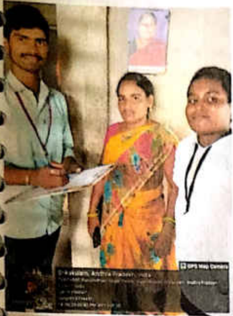
Srikakulam, Andhra Pradesh, India 14.25.2022 11:42 AM GPS Map Camera