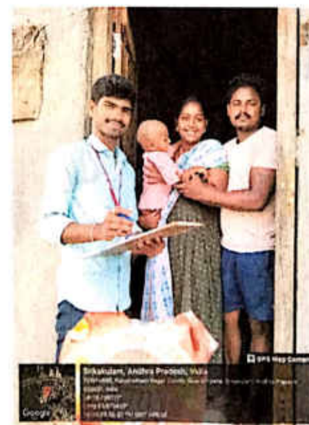
Srikakulam, Andhra Pradesh, India 14.25.2022 11:42 AM GPS Map Camera