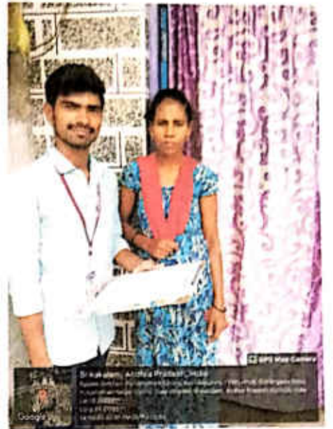
Srikakulam, Andhra Pradesh, India 14.25.2022 11:42 AM GPS Map Camera