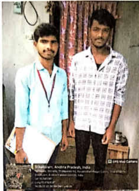
Srikakulam, Andhra Pradesh, India 14.25.2022 11:42 AM GPS Map Camera