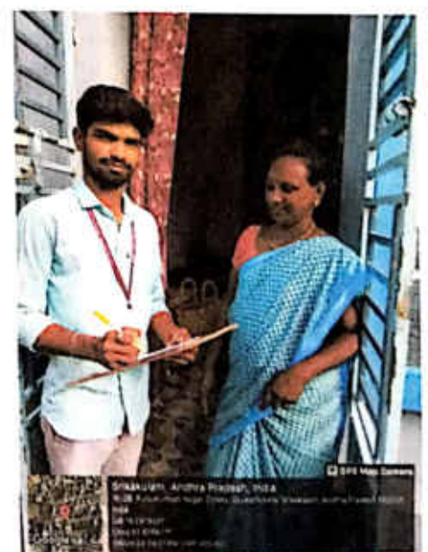
Srikakulam, Andhra Pradesh, India 14.25.2022 11:42 AM GPS Map Camera