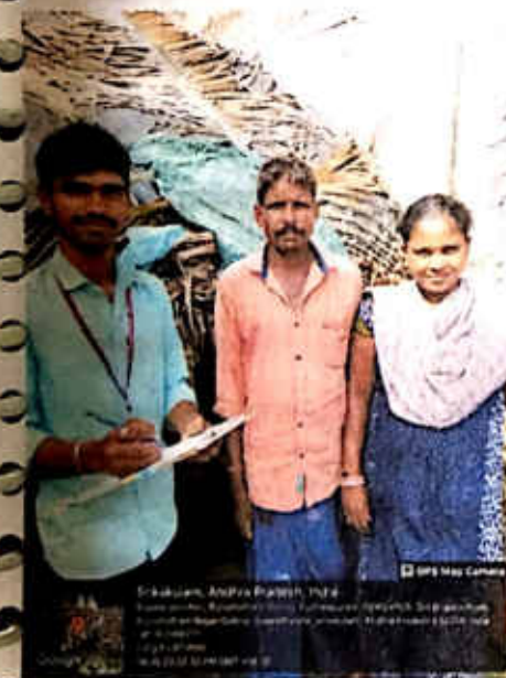
Srikakulam, Andhra Pradesh, India 14.25.2022 11:42 AM GPS Map Camera