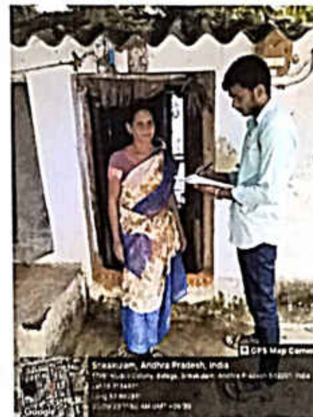
GPS Map Camera Bhikshulam, Andhra Pradesh, India 178, 180, 182 Colony, Bt Road, Bhikshulam, Andhra Pradesh 512207, India Lat 16.3146547 Long 82.8322607 22104 23 1948 AM GMT +05:30