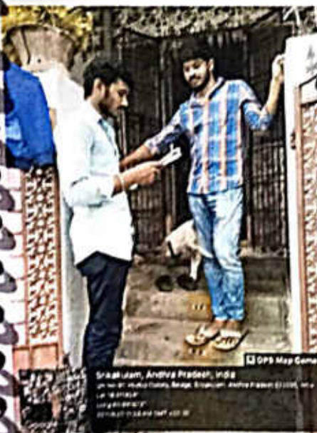
Srikakulam, Andhra Pradesh, India GPS Map Camera 2019-07-10 10:00:00 AM GMT +05:30