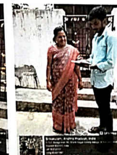
Srikakulam, Andhra Pradesh, India GPS Map Camera 2019-07-10 10:00:00 AM GMT +05:30