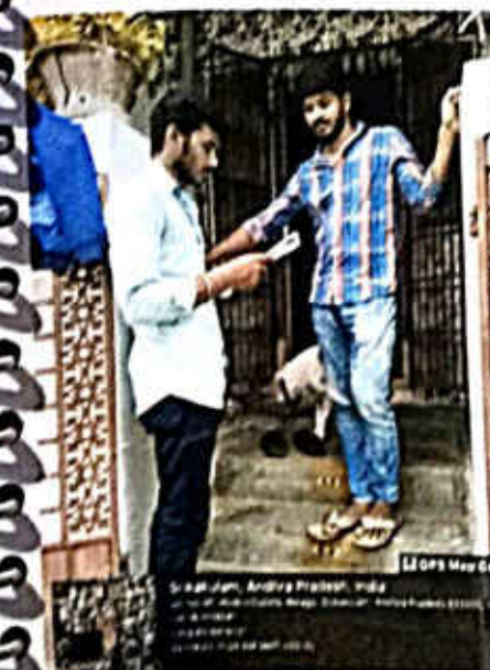
Srikakulam, Andhra Pradesh, India GPS Map Camera 2019-07-10 10:00:00 AM GMT +05:30