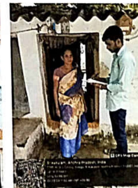
GPS Map Camera Bhikshulam, Andhra Pradesh, India 178, 180, 182 Colony, Bt Road, Bhikshulam, Andhra Pradesh 512207, India Lat 16.3146547 Long 82.8322607 22104 23 1948 AM GMT +05:30