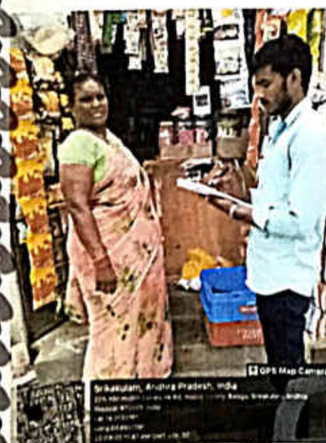
GPS Map Camera Bhikshulam, Andhra Pradesh, India 178, 180, 182 Colony, Bt Rd, Madhav Colony, Bt Road, Bhikshulam, Andhra Pradesh 512207, India Lat 16.3146547 Long 82.8322607 22104 23 1948 AM GMT +05:30