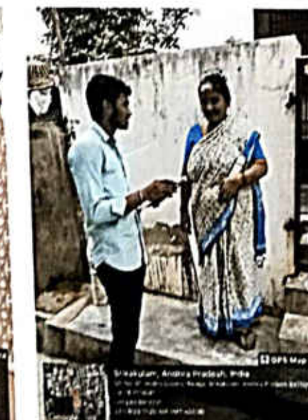
Srikakulam, Andhra Pradesh, India GPS Map Camera 2019-07-10 10:00:00 AM GMT +05:30