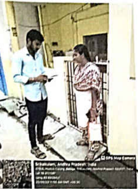
Srikakulam, Andhra Pradesh, India GPS Map Camera 2019-07-10 10:00:00 AM GMT +05:30

అంబేద్కర్ జన్మశతాబ్ది సందర్భంగా గ్రామీణులకు సేవలు అందించే ప్రయత్నం