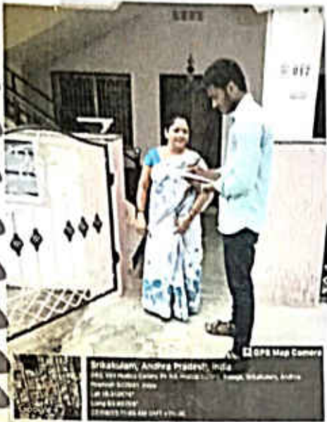
GPS Map Camera Bhikshulam, Andhra Pradesh, India 178, 180, 182 Colony, Bt Rd, Madhav Colony, Bt Road, Bhikshulam, Andhra Pradesh 512207, India Lat 16.3146547 Long 82.8322607 22104 23 1948 AM GMT +05:30