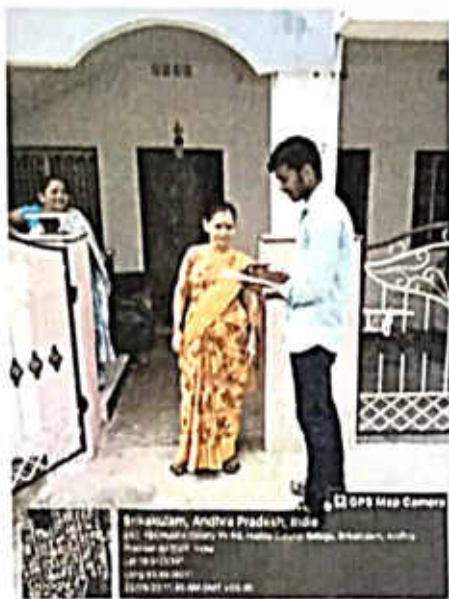
GPS Map Camera Bhikshulam, Andhra Pradesh, India 178, 180, 182 Colony, Bt Rd, Madhav Colony, Bt Road, Bhikshulam, Andhra Pradesh 512207, India Lat 16.3146547 Long 82.8322607 22104 23 1948 AM GMT +05:30