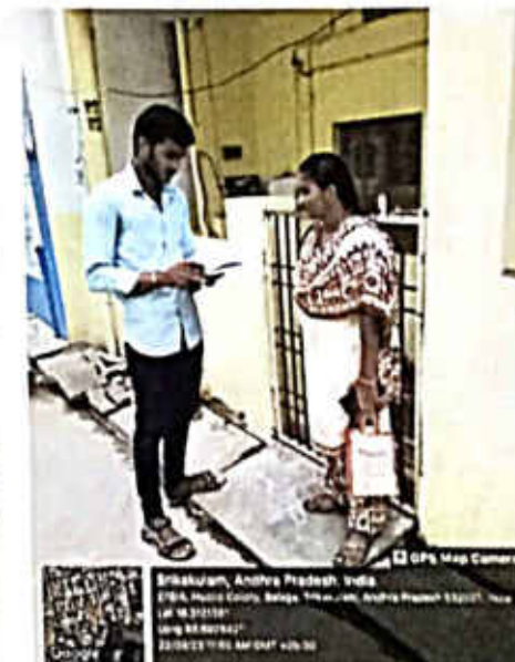
Bhikshulam, Andhra Pradesh, India 178, 180, 182 Colony, Bt Road, Bhikshulam, Andhra Pradesh 512207, India Lat 16.3146547 Long 82.8322607 22104 23 1948 AM GMT +05:30