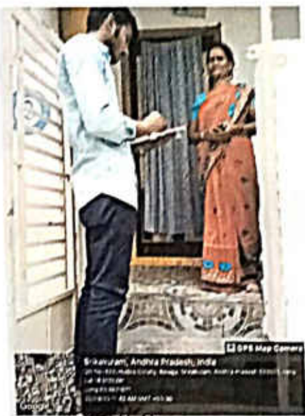
Srikakulam, Andhra Pradesh, India GPS Map Camera 2019-07-10 10:00:00 AM GMT +05:30