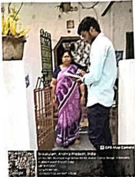
Srikakulam, Andhra Pradesh, India GPS Map Camera 2019-07-10 10:00:00 AM GMT +05:30