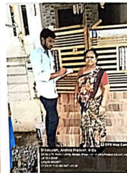
Srikakulam, Andhra Pradesh, India GPS Map Camera 2019-07-10 10:00:00 AM GMT +05:30