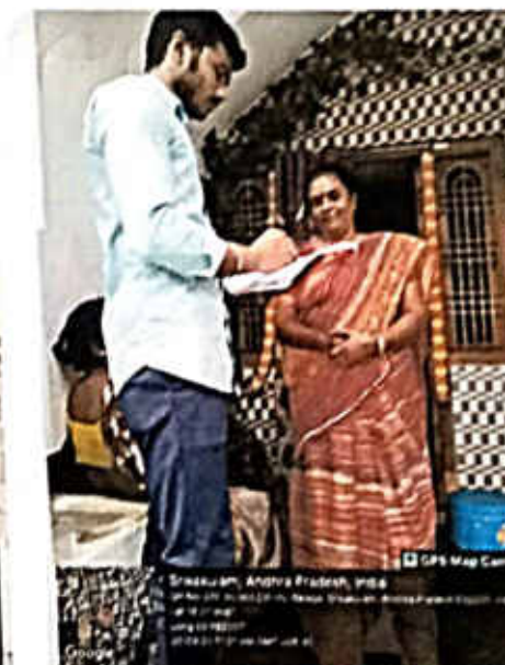
Srikakulam, Andhra Pradesh, India GPS Map Camera 2019-07-10 10:00:00 AM GMT +05:30