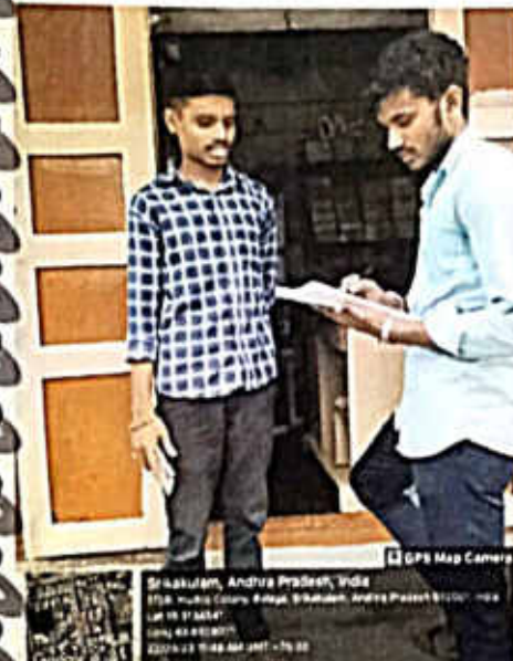
GPS Map Camera Bhikshulam, Andhra Pradesh, India 178, 180, 182 Colony, Bt Road, Bhikshulam, Andhra Pradesh 512207, India Lat 16.3146547 Long 82.8322607 22104 23 1948 AM GMT +05:30