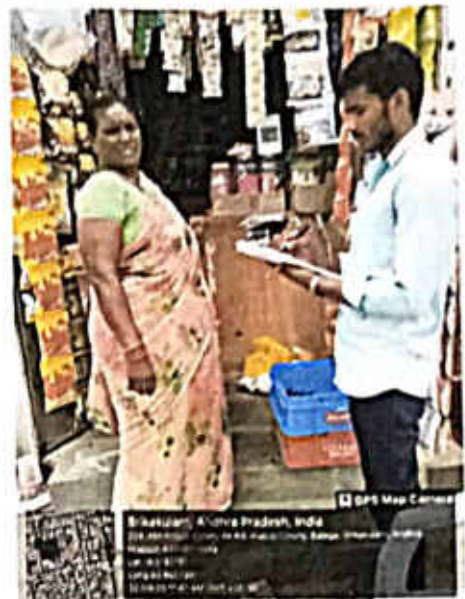
GPS Map Camera Bhikshulam, Andhra Pradesh, India 178, 180, 182 Colony, Bt Rd, Madhav Colony, Bt Road, Bhikshulam, Andhra Pradesh 512207, India Lat 16.3146547 Long 82.8322607 22104 23 1948 AM GMT +05:30