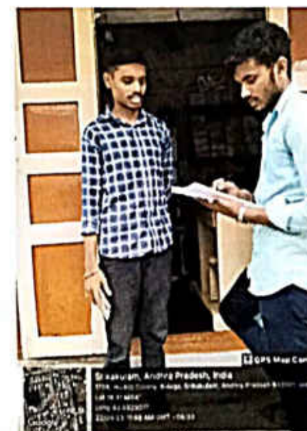
GPS Map Camera Bhikshulam, Andhra Pradesh, India 178, 180, 182 Colony, Bt Road, Bhikshulam, Andhra Pradesh 512207, India Lat 16.3146547 Long 82.8322607 22104 23 1948 AM GMT +05:30