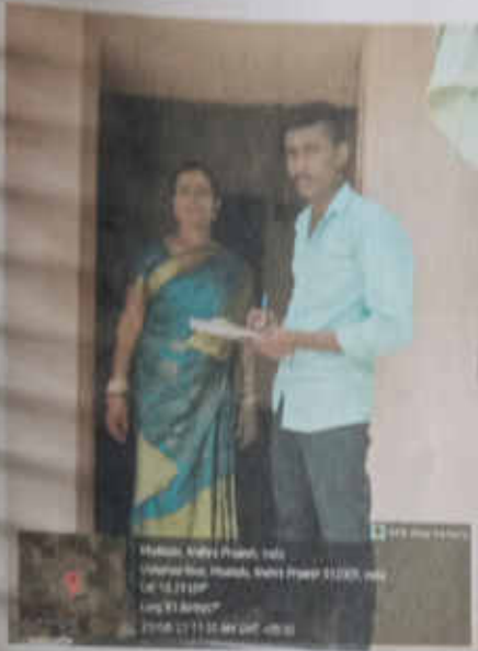
Mulbali, Andhra Pradesh, India Internal Use: Mulbali, Andhra Pradesh 512005, India Lat: 18.211107° Long: 81.866617° 25/08/21 11:44 AM GMT+05:30