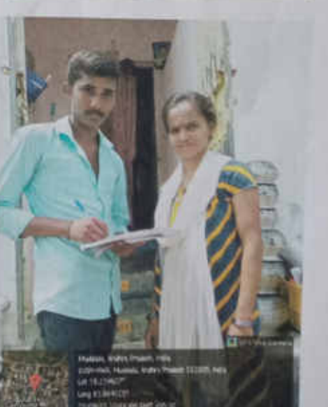
Mumbai, Andhra Pradesh, India 500004, Mumbai, Andhra Pradesh 520005, India Lat: 18.239417° Long: 81.869437° 23/08/21 10:02 AM GMT +05:30