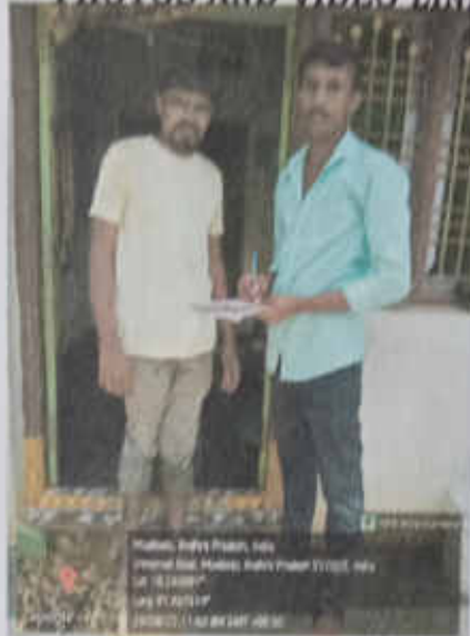
Mulbali, Andhra Pradesh, India Internal Use: Mulbali, Andhra Pradesh 512005, India Lat: 18.210907° Long: 81.867117° 25/08/21 11:42 AM GMT+05:30