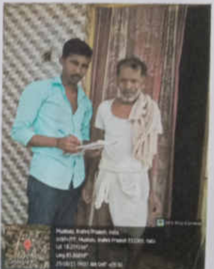
Mulbali, Andhra Pradesh, India Internal Use: Mulbali, Andhra Pradesh 512005, India Lat: 18.210907° Long: 81.866617° 25/08/21 11:52 AM GMT+05:30