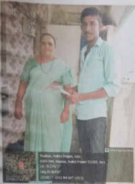
Mumbai, Andhra Pradesh, India 500004, Mumbai, Andhra Pradesh 520005, India Lat: 18.239417° Long: 81.869437° 23/08/21 10:02 AM GMT +05:30