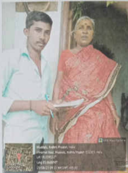
Mumbai, India Pradesh, India Varnal Road, Mumbai, India Pradesh 400021, India Lat: 18.239121° Long: 72.848917° 23/08/21 09:53 AM GMT +05:30