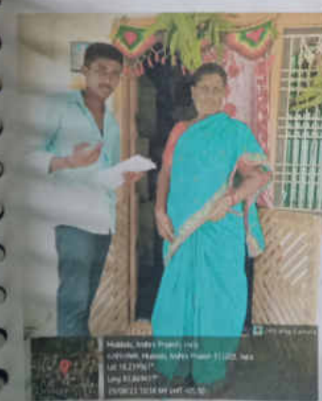
Mumbai, Andhra Pradesh, India 500004, Mumbai, Andhra Pradesh 520005, India Lat: 18.239417° Long: 81.869437° 23/08/21 10:02 AM GMT +05:30