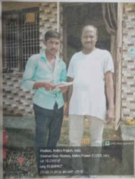
Mumbai, India Pradesh, India Varnal Road, Mumbai, India Pradesh 400021, India Lat: 18.239121° Long: 72.848917° 23/08/21 09:53 AM GMT +05:30