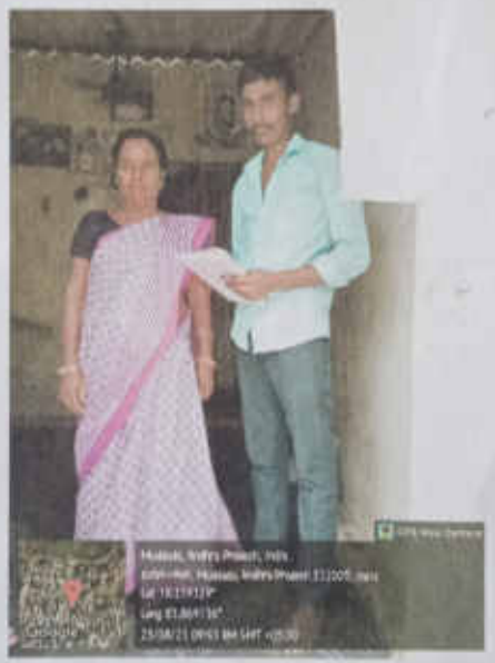
Mumbai, India Pradesh, India Varnal Road, Mumbai, India Pradesh 400021, India Lat: 18.239121° Long: 72.848917° 23/08/21 09:53 AM GMT +05:30