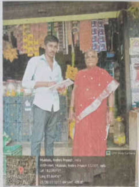
Mumbai, Andhra Pradesh, India 500004, Mumbai, Andhra Pradesh 520005, India Lat: 18.239417° Long: 81.869437° 23/08/21 10:02 AM GMT +05:30