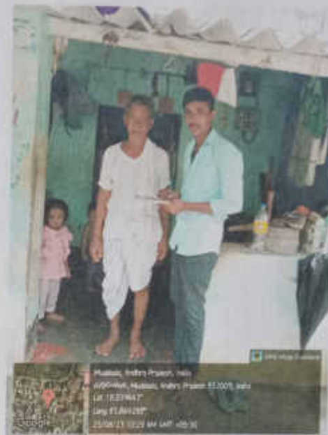
Mumbai, Andhra Pradesh, India 500004, Mumbai, Andhra Pradesh 520005, India Lat: 18.239417° Long: 81.869437° 23/08/21 10:02 AM GMT +05:30