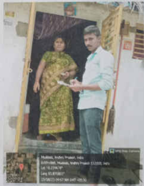
Mumbai, India Pradesh, India Varnal Road, Mumbai, India Pradesh 400021, India Lat: 18.239121° Long: 72.848917° 23/08/21 09:53 AM GMT +05:30