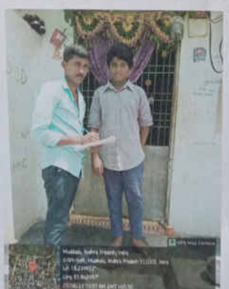
Mumbai, Andhra Pradesh, India 500004, Mumbai, Andhra Pradesh 520005, India Lat: 18.239417° Long: 81.869437° 23/08/21 10:02 AM GMT +05:30