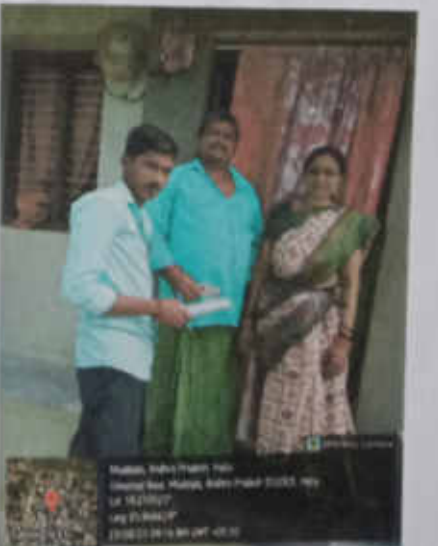
Mulbali, Andhra Pradesh, India Internal Use: Mulbali, Andhra Pradesh 512005, India Lat: 18.210907° Long: 81.866617° 25/08/21 12:19 AM GMT+05:30