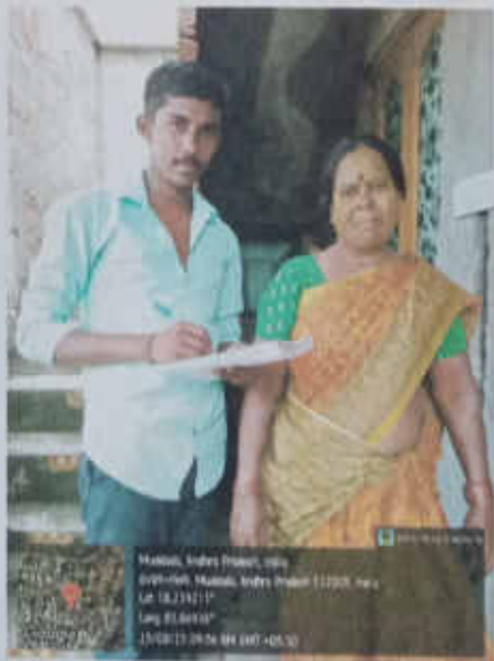
Mumbai, India Pradesh, India Varnal Road, Mumbai, India Pradesh 400021, India Lat: 18.239121° Long: 72.848917° 23/08/21 09:53 AM GMT +05:30