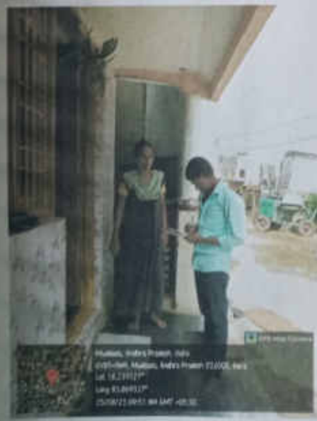
Mumbai, India Pradesh, India Varnal Road, Mumbai, India Pradesh 400021, India Lat: 18.239121° Long: 72.848917° 23/08/21 09:53 AM GMT +05:30