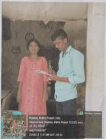
Mulbali, Andhra Pradesh, India Internal Use: Mulbali, Andhra Pradesh 512005, India Lat: 18.210907° Long: 81.866617° 25/08/21 11:51 AM GMT+05:30