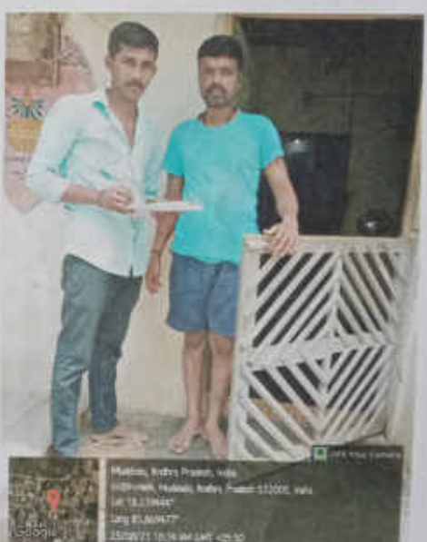
Mumbai, Andhra Pradesh, India 500004, Mumbai, Andhra Pradesh 520005, India Lat: 18.239417° Long: 81.869437° 23/08/21 10:02 AM GMT +05:30