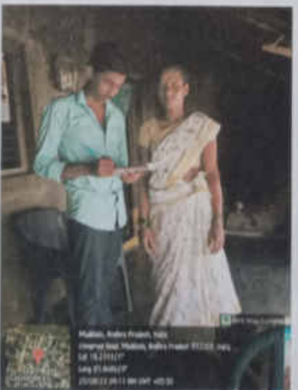
Mulbali, Andhra Pradesh, India Internal Use: Mulbali, Andhra Pradesh 512005, India Lat: 18.210907° Long: 81.866617° 25/08/21 12:11 AM GMT+05:30