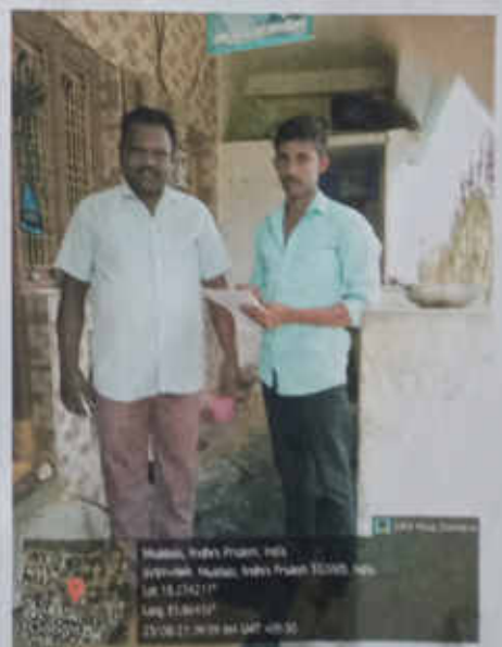
Mumbai, India Pradesh, India Varnal Road, Mumbai, India Pradesh 400021, India Lat: 18.239121° Long: 72.848917° 23/08/21 09:53 AM GMT +05:30