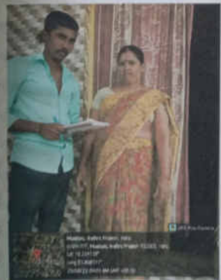
Mulbali, Andhra Pradesh, India Internal Use: Mulbali, Andhra Pradesh 512005, India Lat: 18.210907° Long: 81.866617° 25/08/21 12:01 AM GMT+05:30