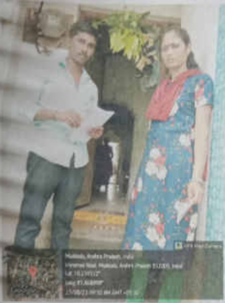
Mumbai, India Pradesh, India Varnal Road, Mumbai, India Pradesh 400021, India Lat: 18.239121° Long: 72.848917° 23/08/21 09:53 AM GMT +05:30