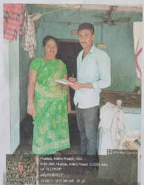
Mumbai, Andhra Pradesh, India 500004, Mumbai, Andhra Pradesh 520005, India Lat: 18.239417° Long: 81.869437° 23/08/21 10:02 AM GMT +05:30