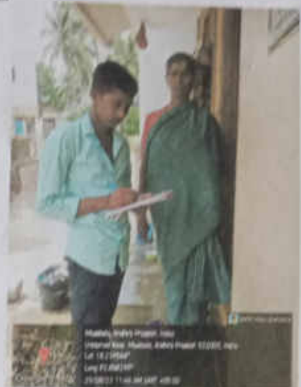
Mulbali, Andhra Pradesh, India Internal Use: Mulbali, Andhra Pradesh 512005, India Lat: 18.210907° Long: 81.866617° 25/08/21 11:44 AM GMT+05:30