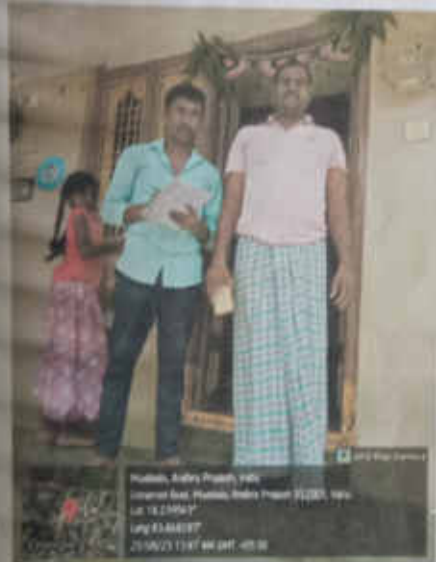
Mulbali, Andhra Pradesh, India Internal Use: Mulbali, Andhra Pradesh 512005, India Lat: 18.210907° Long: 81.866617° 25/08/21 11:47 AM GMT+05:30