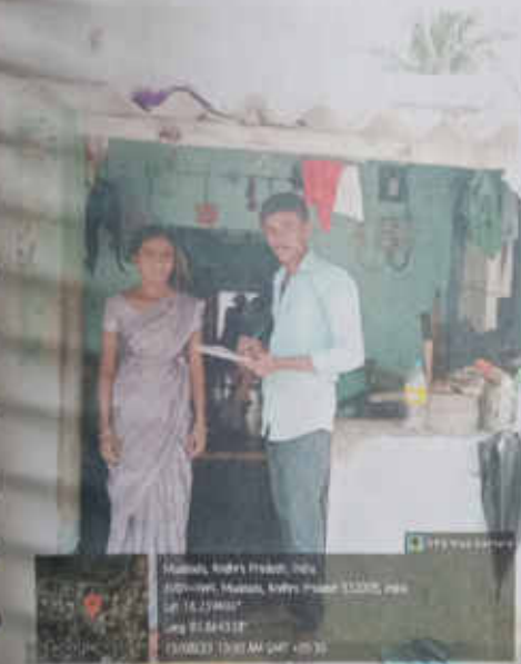
Mumbai, Andhra Pradesh, India 500004, Mumbai, Andhra Pradesh 520005, India Lat: 18.239417° Long: 81.869437° 23/08/21 10:02 AM GMT +05:30