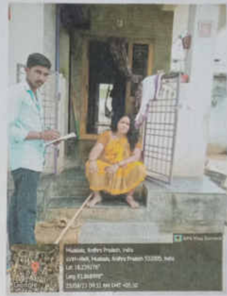
Mumbai, India Pradesh, India Varnal Road, Mumbai, India Pradesh 400021, India Lat: 18.239121° Long: 72.848917° 23/08/21 09:53 AM GMT +05:30