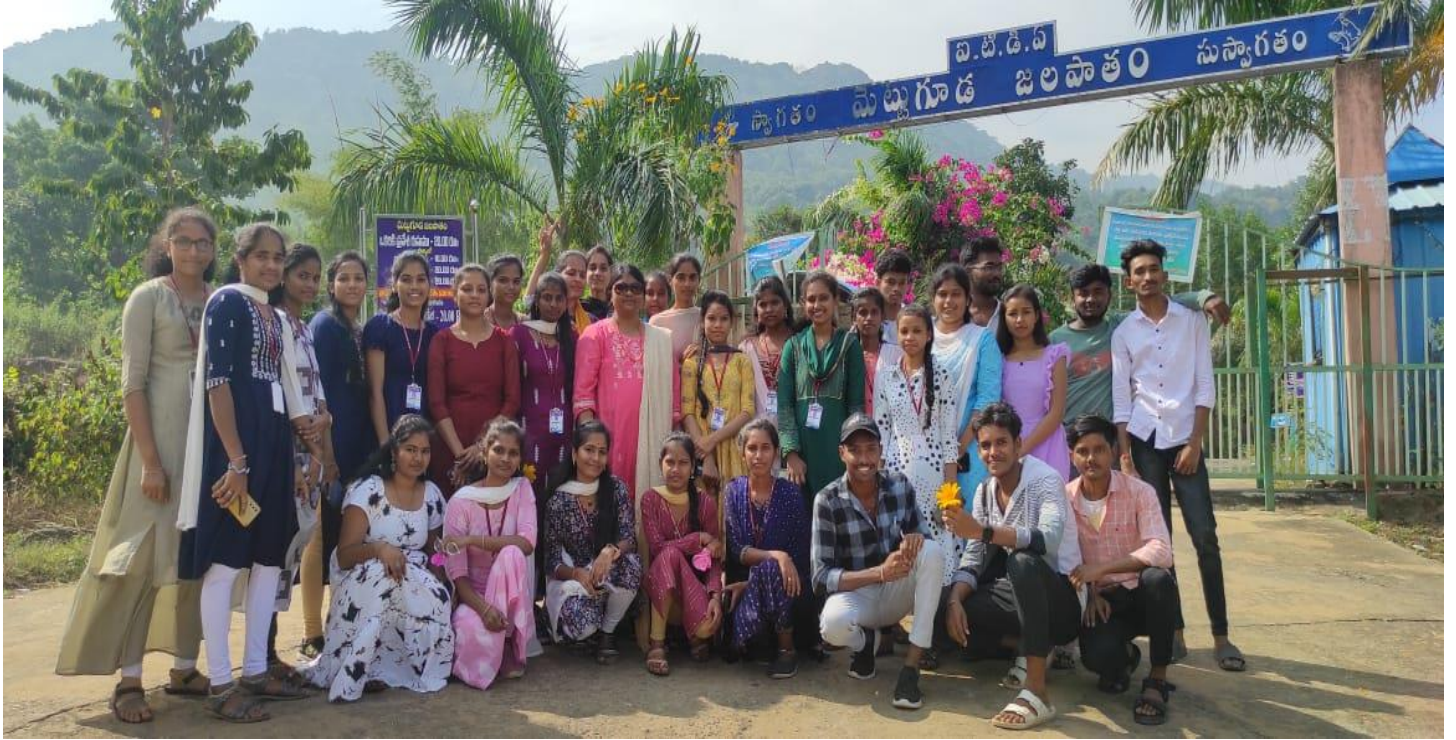
BOTANICAL FIELD TRIP TO SEETHAMPETA ON 15/11/2023