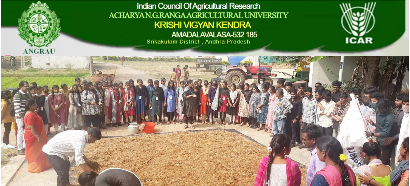
FIELD TRIP TO KVK, AMADALAVALASA on 04-01-2024