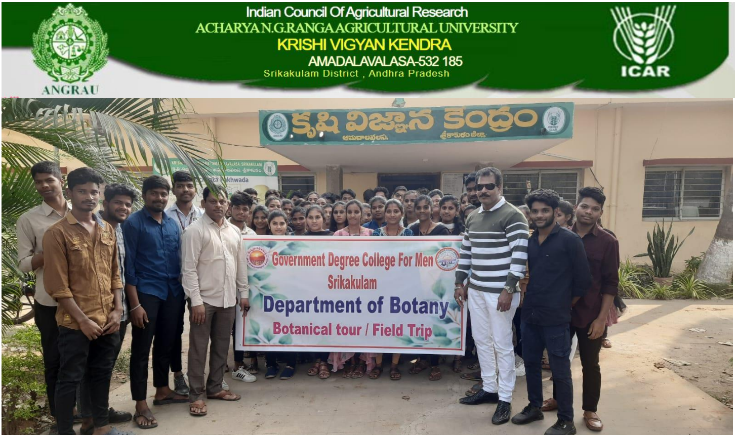
FIELD TRIP TO KVK, AMADALAVALASA on 04-01-2024