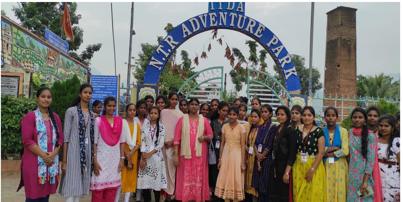
BOTANICAL FIELD TRIP TO SEETHAMPETA ON 15/11/2023