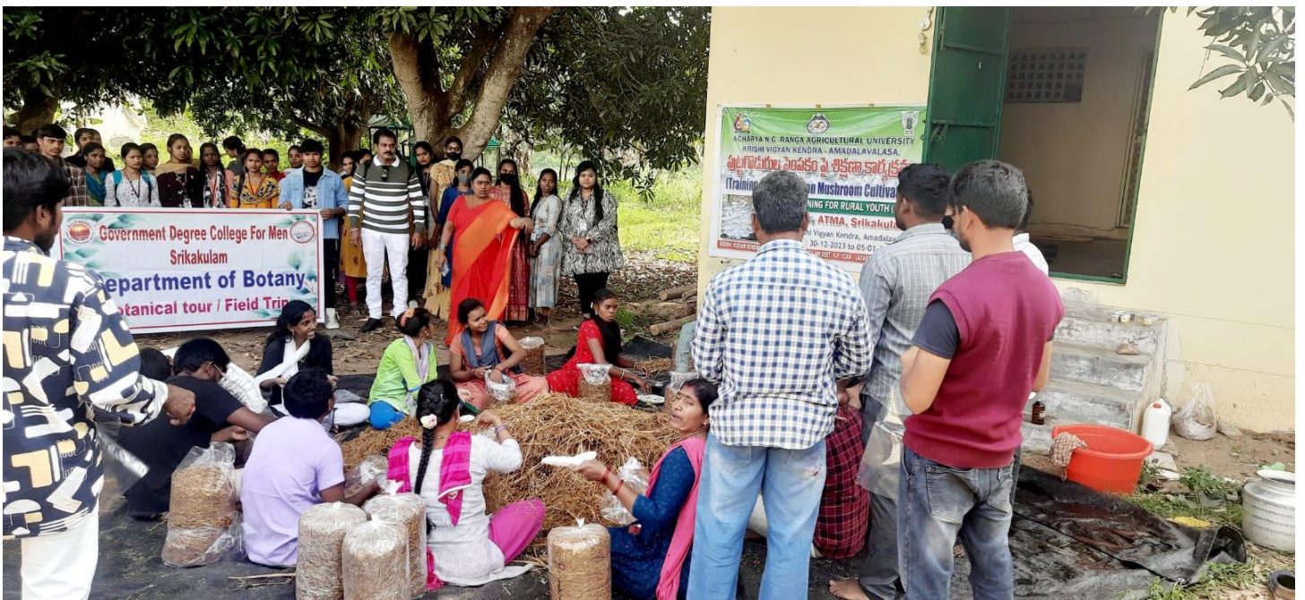
FIELD TRIP TO KVK, AMADALAVALASA on 04-01-2024