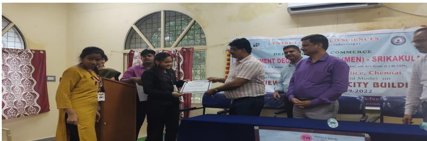
Certificates Distribution to the Participants