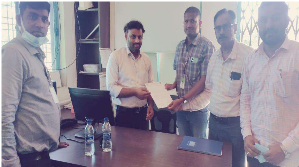
Visit to Pydibhimavaram Pharmacueticals