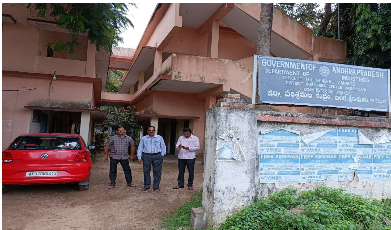
Visit to District Industry Centre