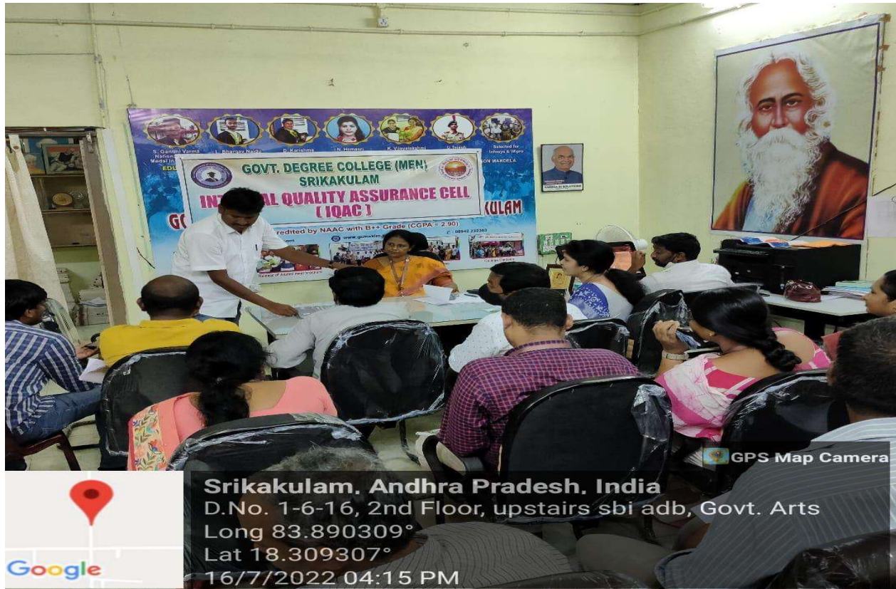
Awareness on iMAP (Internship Monitoring App) to faculty