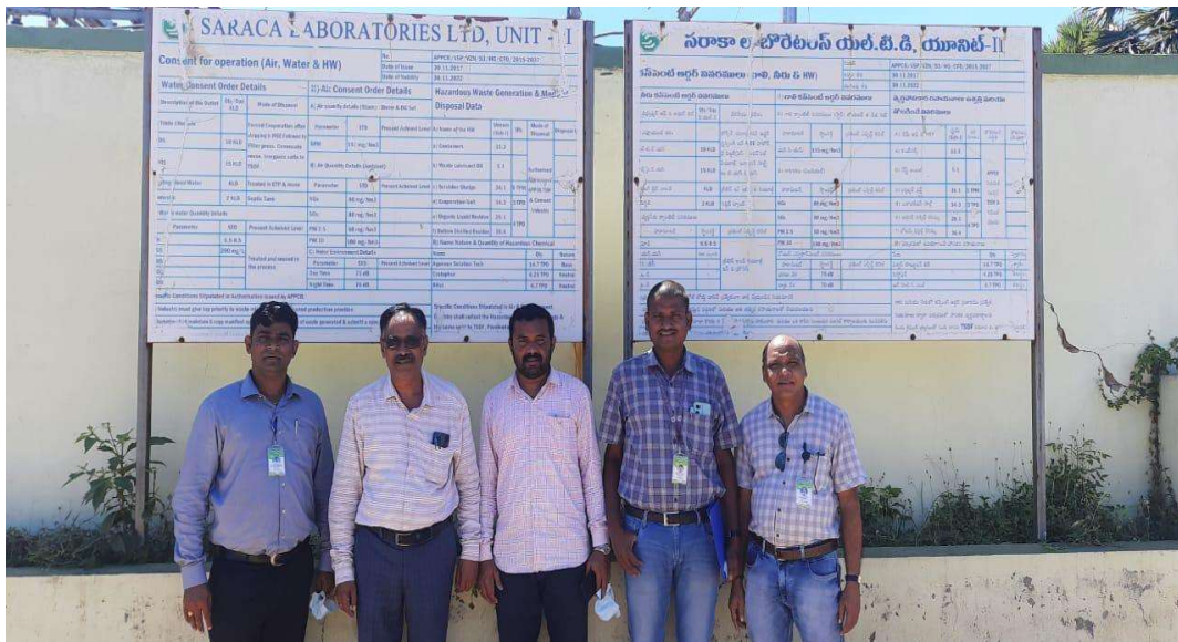
Visit to Pydibhimavaram Pharmacueticals

Partnerships with several local industries were established, ensuring diverse internship opportunities for students.